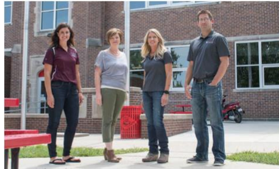
program several years ago, allowing the school to make a $30,000 purchase for in- the needs of the students. New windows and a new HVAC system were installed in

What's more, Pender Public Schools is growing and continually striving to improve the education and offerings to students.