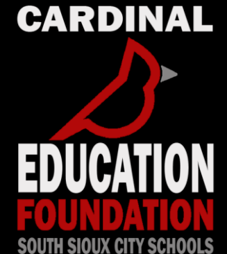
Lance Swanson South Sioux City